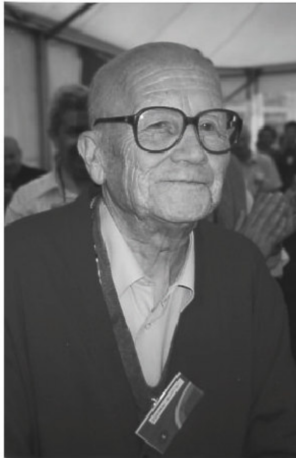
E d u a r d o B o n n i n Founder of the Cursillo Movement

THE NATIONAL BULLETIN OF THE CANADIAN CONFERENCE OF CATHOLIC CURSILLOS